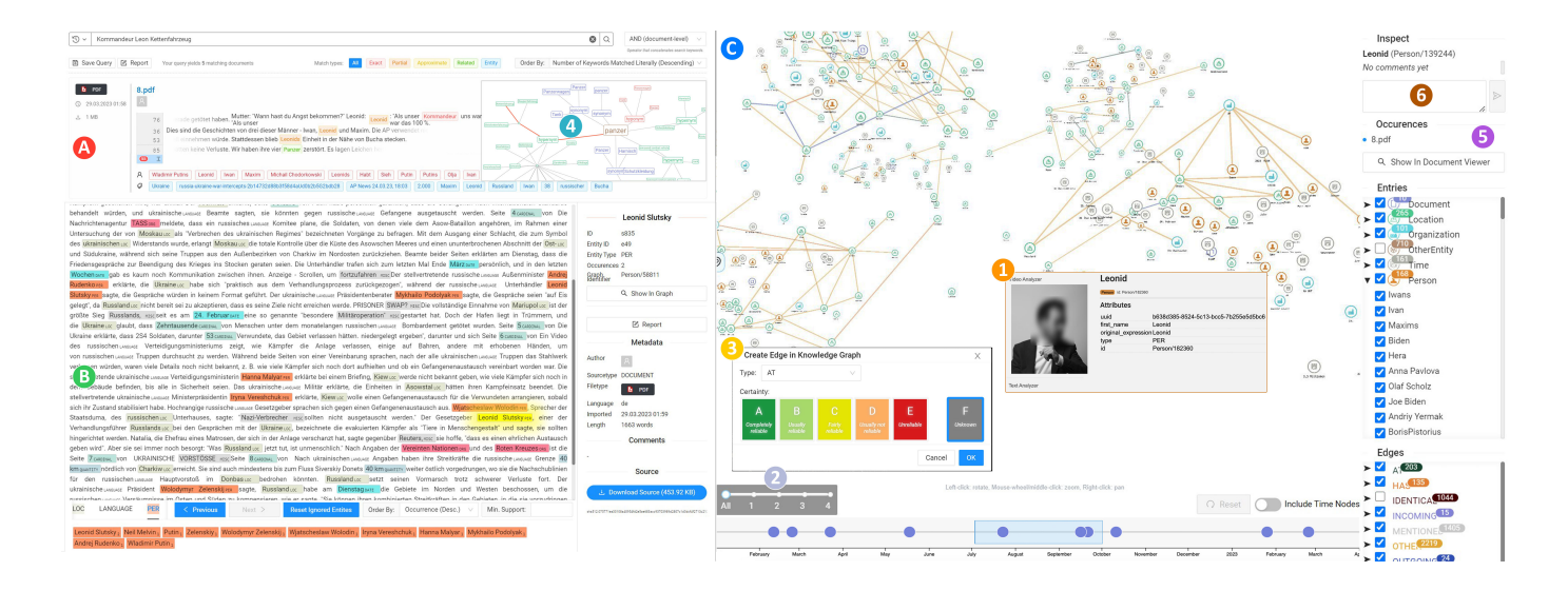
Fig. 1. MULTI-CASE: A holistic visual analytics framework tailored towards ethics-aware and multimodal intelligence exploration. Built upon a fully-integrated data model, it features type-specific, graph-based analysis through individual models with multiple, linked components: a combined ontological search and result interface, an interactive textual view, and a specialized modules like video or audio analysis. The interface facilitates relevance scoring for accountability and oversight, relevance scoring for accountability and oversight, transparent source explanations, integrated navigation, and collaborative user participation.

(d) time-series analysis, for example, to identify particular communication patterns. However, these modalities should not be considered to work in isolation but contribute individual perspectives for corroborating, enhancing, and setting each other in context. For example, to attribute war crimes in our case study (see Section V-A), our journalist Alisa leverages semantic analysis, geolocation, link-analysis, and time-correlation together with several other methods to achieve her objectives.